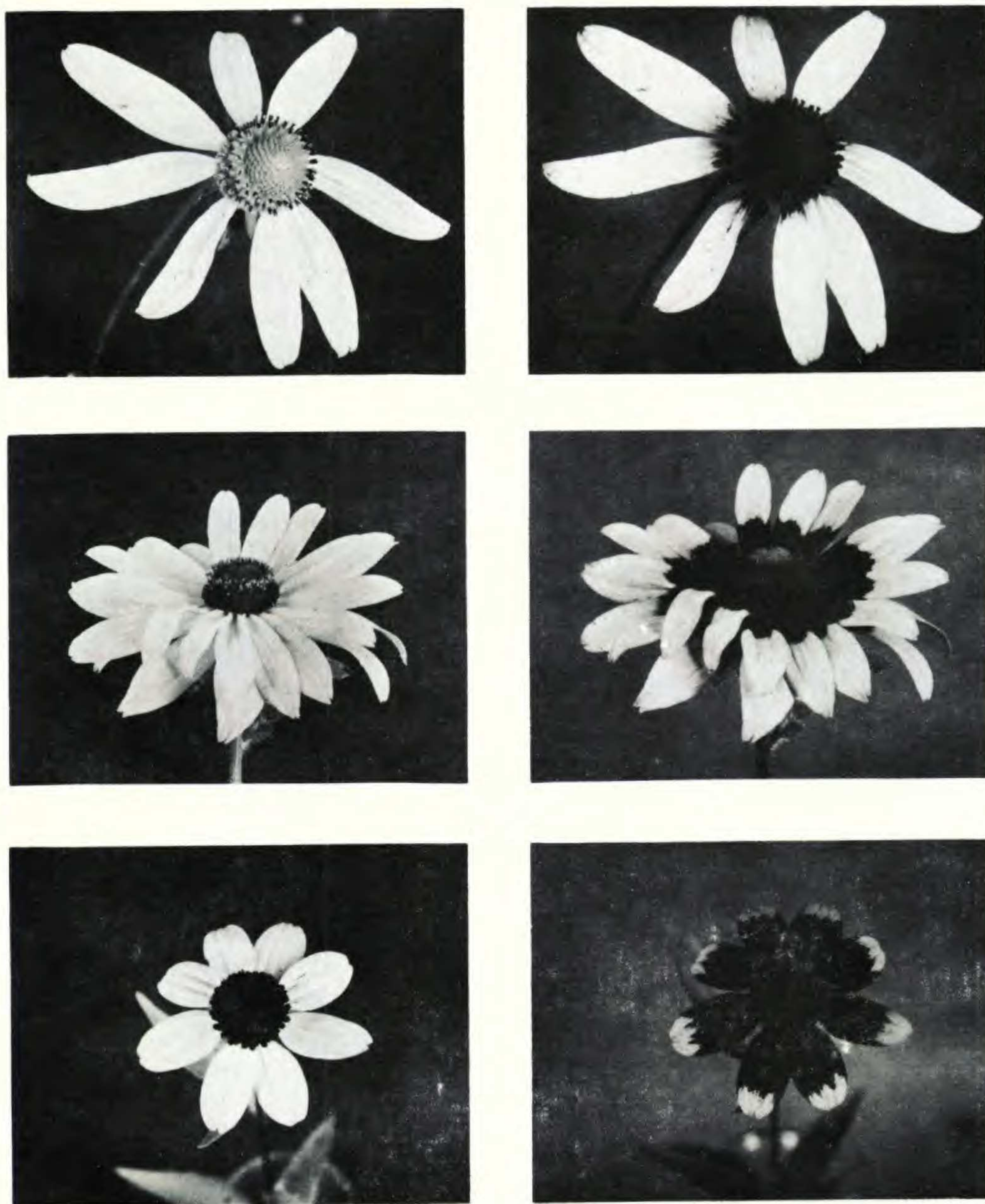
Figure 2. Visible and ultraviolet light reflection and absorption patterns in Rudbeckia . Top row, R. laciniata : left, visible light, right, UV light. Middle row, R. hirta : left, visible light, right, UV light. Bottom row, R. triloba : left, visible light, right, UV light. All shown at approximately the same scale.